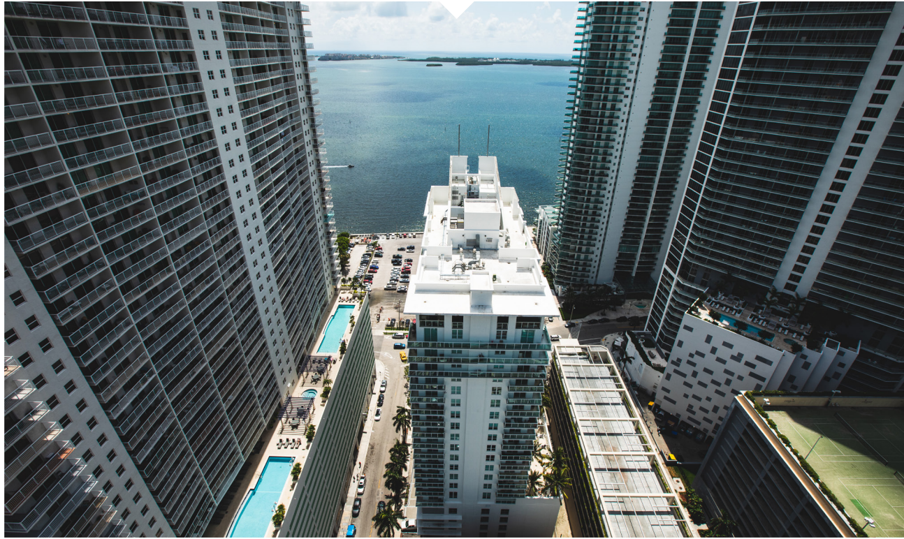
VIEWS FROM THE 25 TH FLOOR