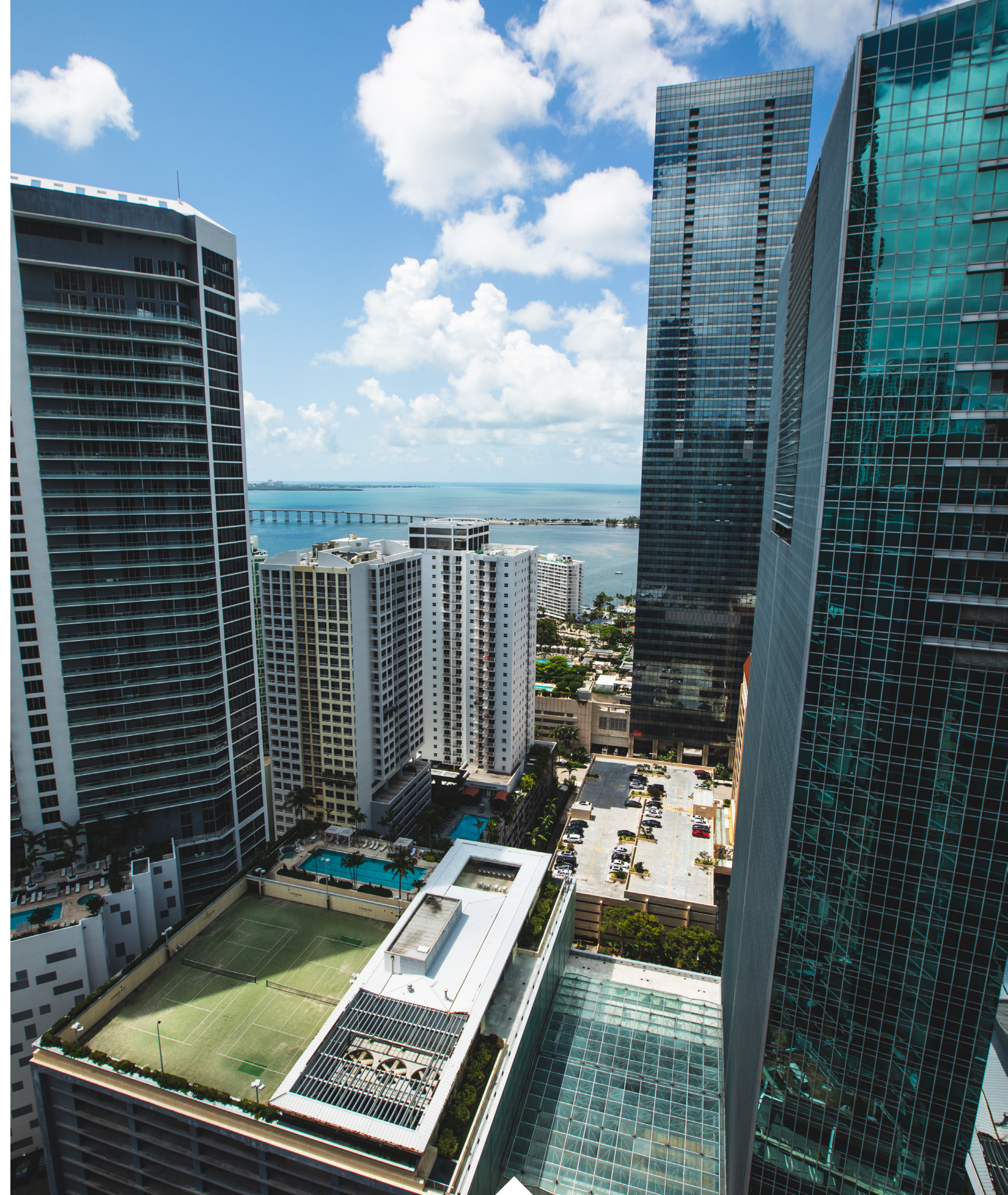
VIEWS FROM THE 25 TH FLOOR